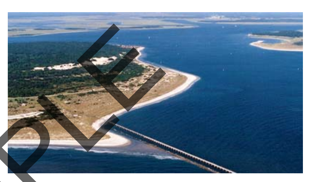
You are a naturalist, by definition when you move to the Sea Islands

Amelia Island is one of a few native coastal hammocks found exclusively on northeast Florida's coast, where barely-discrete ecosystems are identified in measurably diverse environments: upland dunes, maritime woodlands and needle rush ponds.