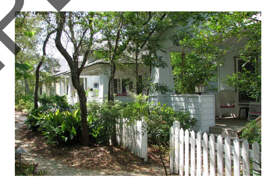
Scenes from the Garden Walk

Interwoven throughout Amelia Park is the Garden Walk, very special neighborhoods of residences, which front wonderfully diverse native greens enhanced with lush specimen foliage. Garden Walk blocks were designed to take advantage of existing and mature landscape, preserving and enhancing the natural habitat and providing a pedestrian network that weaves its way through the entire neighborhood. The Garden Walk includes homes fronting on these greens such that their architecture becomes part of the public realm. Walks are designed to take advantage of special structures and natural features as terminating vistas. The Garden Walk includes two-story lakefront homes that are designed to take advantage of views and prevailing sea breezes.