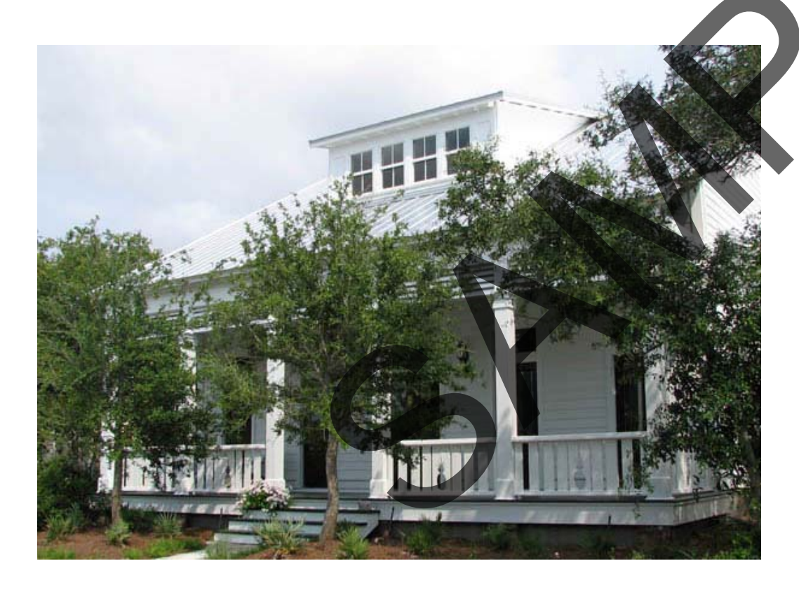
Examples of Coastal Neighborhood Homes

Located in the northwest corner of Amelia Park, the Coastal Neighborhoods promote an attitude of preservation by embracing the ethic of conservation. The Coastal Neighborhoods are intentionally and distinctly more organic by interweaving natural and built environments. Discrete ecosystems are identified and enhanced in measurably diverse environments. Through careful study of aesthetic and functional details inherent in timeless architectural styles of the coastal sea islands, a narrow range of appropriate historical precedents has been established exclusively for the Coastal Neighborhoods. A carefully chosen palette of approved materials, selected for ageless qualities, durability and maintenance, combined with a limited color palette work to harmonize with the natural woodland setting. The goal of maintaining lasting value is manifest through the use of superior materials and craftsmanship.