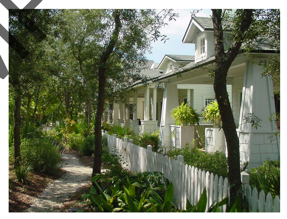
One of the Cottage Blocks in Amelia Park's Garden Walk

Preserving the environment is responsible and beneficial to the quality of life.