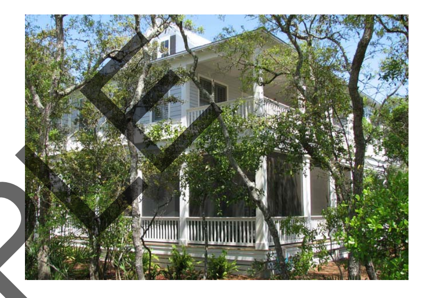
Examples of building within the natural setting

Despite the careful planning involved in defining Amelia Park, it continues to evolve, never lapsing into the prescribed, but allowing for flexibility, and encouraging ideas to evolve and nurture the original visions and goals of the community. It requires that we remain authentic, connected to our unique history and traditions, while applying the highest operational standards, capable of harnessing cutting edge technology.